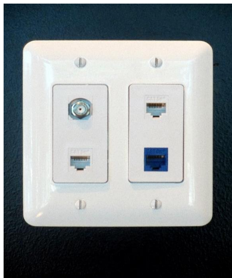
Home Office outlet (Coax/RG-6 & 3ea CAT-6)