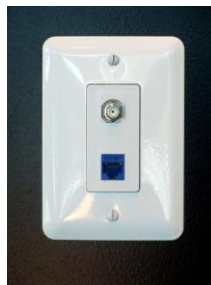
Multi-media outlet (Coax/RG-6 & CAT-6)