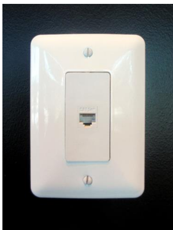
Telephone Outlet CAT-5e

NOTE: TWO-LINE SERVICE MUST BE ORDERED FROM THE PHONE COMPANY.