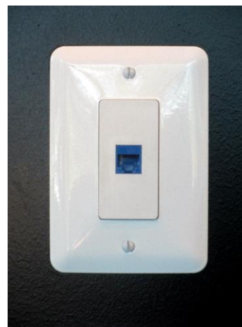
Computer Network CAT-6