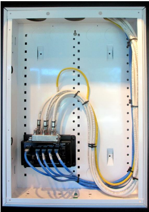
Structured wiring panel

If a homeowner has a requirement for more than one computer to be connected to the broadband Internet service, the Computer Network option will be required.