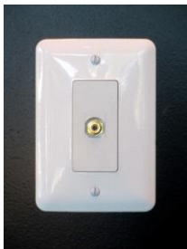
TV outlet (Coax/RG-6)